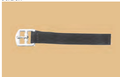
NYLON STIRRUP STRAP

2" wide nylon web with fleece lining nickel plated hardware. Color:black(4),brown(6) 20/Box