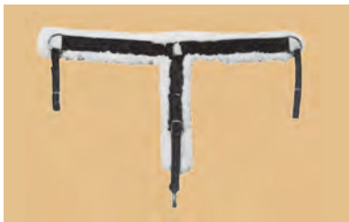
NO.1780 NYLON BREAST STRAP

2" wide nylon web with fleece lining nickel plated hardware. Color:black(4),brown(6) 20/Box