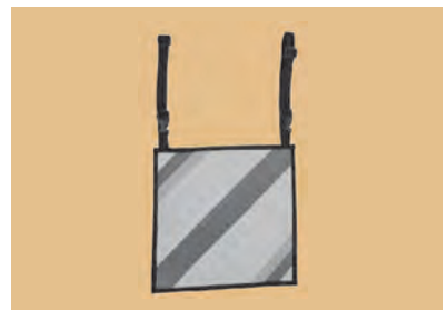
NO.1429 WARNING REFLECTING SIGNS

For driving with adjustable strap & plastic quick release buckle. Size:30x30cm(12"x12") 50/Box