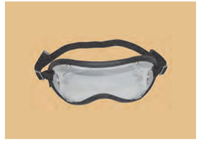
NO.1615 RACE GOGGLE