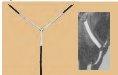
NO.1434 REFLECTING BREAST PLATE

Reflecting breastplate from nylon with a snap hook. Easy adjustable size from cob to full size, 100% nylon web. 100/Box