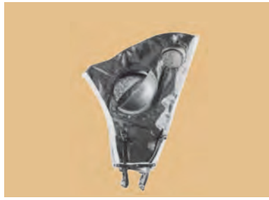
NO.1654 NYLON BLINKER HOOD LESS CUP