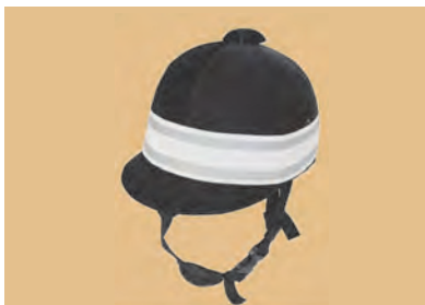
NO.1490 REFLECTIVE HELMET BANDS

Velcro closer Width:50mm Length:370mm 200/Box