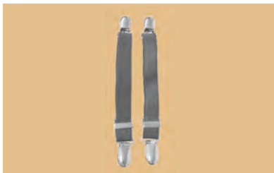
NO.1639 JODHPUR CLIPS

5/8" width, with nylon web, stitch white color, rein grip. Color:black web(4) 100/Box