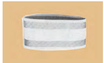
NO.1438 ELASTIC FLUORESCENT REFLECTOR

Reflecting breastplate from nylon with a snap hook. Easy adjustable size from cob to full size, 100% nylon web. 100/Box