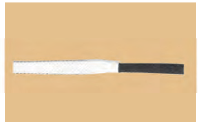
NO.1774 RUBBER COVER REIN

5/8" width, with nylon web, stitch white color, rein grip. Color:black web(4) 100/Box